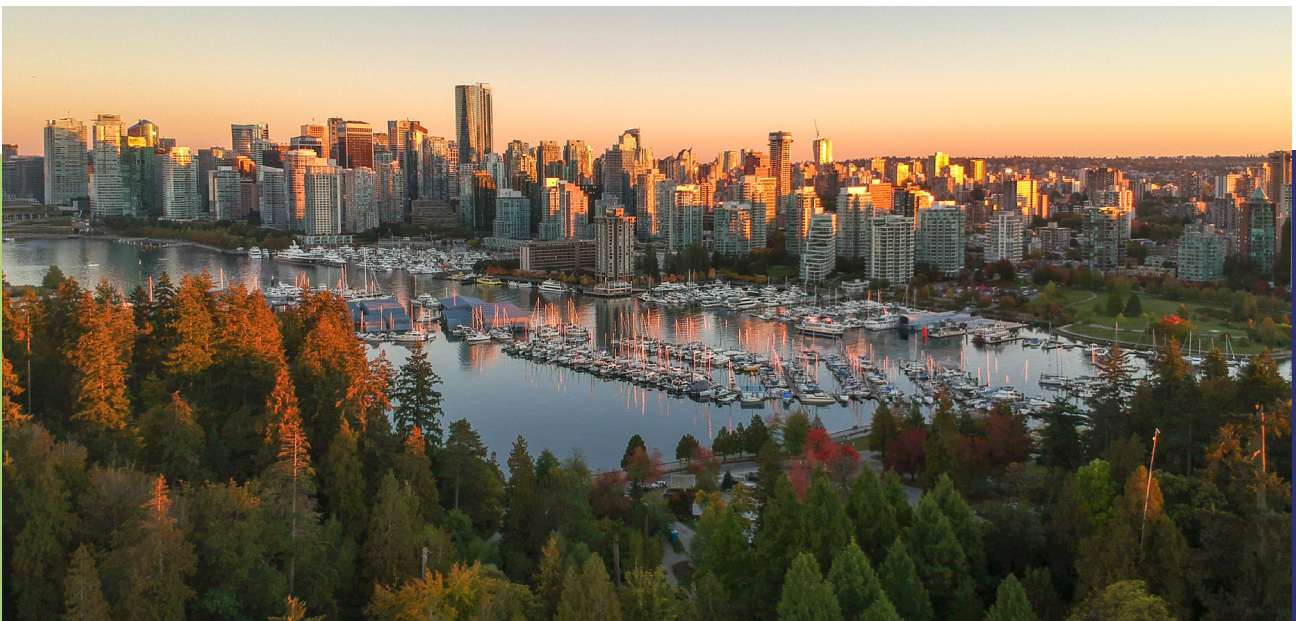
Metro Vancouver Area, BC.

Enjoy your time with us as you learn, grow, and take your career to the next level at Excel Career College!