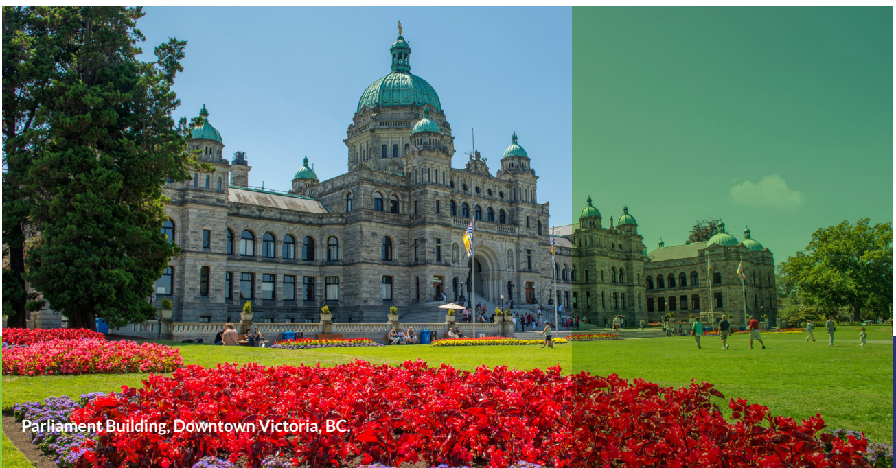
Parliament Building, Downtown Victoria, BC.

Enjoy your time with us as you learn, grow, and take your career to the next level at Excel Career College!